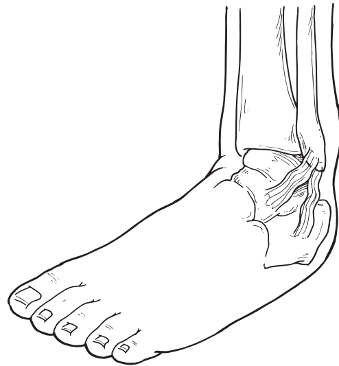
Injured ankle with laxity of ligaments

Chronic ankle instability usually develops following an ankle sprain that has not adequately healed or was not rehabilitated completely. When you sprain your ankle, the connective tissues (ligaments) are stretched or torn. The ability to balance is often affected. Proper rehabilitation is needed to strengthen the muscles around the ankle and “retrain” the tissues within the ankle that affect balance. Failure to do so may result in repeated ankle sprains.